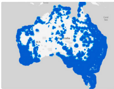
TELSTRA CAT M1 COVERAGE

Designed for harsh environments. Wildeye® connects to global IoT cellular networks for maximum global coverage. There is no need for complicated radio infrastructure. Scale from one to thousands of sensors with minimal investment.