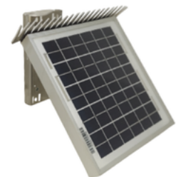
Optional Solar Panel

Your Wildeye® can be supplied with either ultra long life internal batteries or a rechargeable version from solar panels, battery packs or mains power.