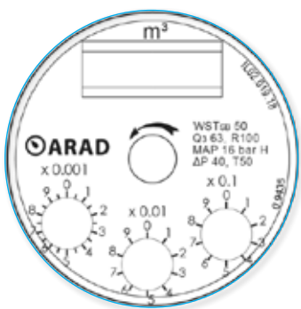
WSTsb type dial